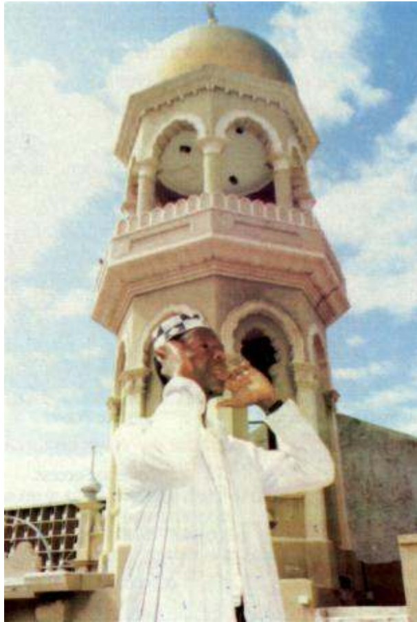
THE MUEZZIN CALLING THE FAITHFUL TO PRAYER