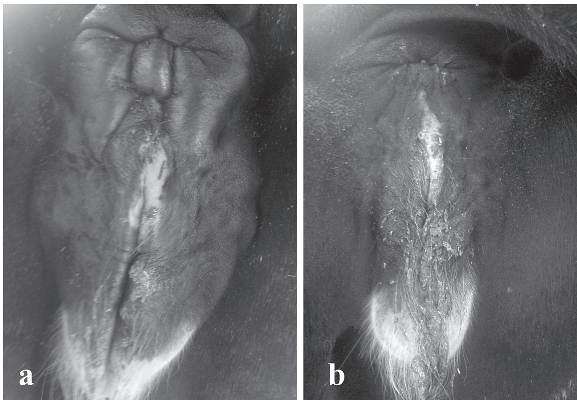
Figure 3. Edema in the anal and external genital area; a – within minutes of the intramuscular injection of penicillin-streptomycin, b – recovery 20 h after treatment.