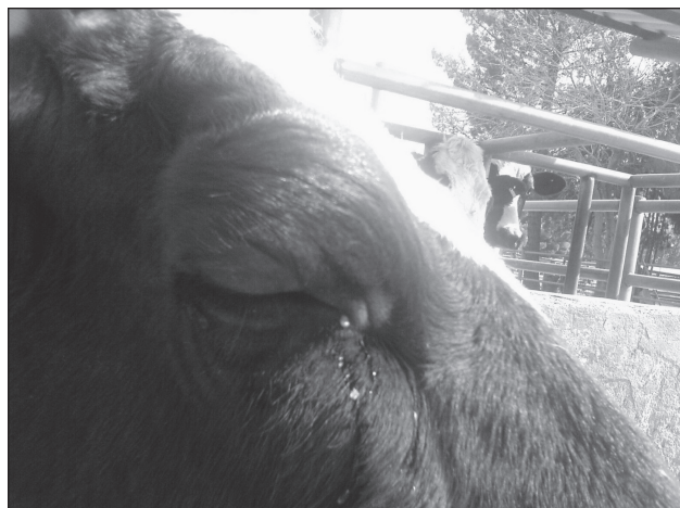
Figure 1. Severe facial edema especially around the eyes (facial-conjunctival angioedema) and lacrimation observed within minutes of the intramuscular injection of penicillin-streptomycin.

A 5-year-old Holstein Friesian cow was given an intramuscular injection of combined penicillin and streptomycin (Penicillin G procaine 3 MIU & Dihydrostreptomycin sulfate eq. to 3 g base; Nasr, Fariman, Iran) to treat a wound in the leg. This cow had